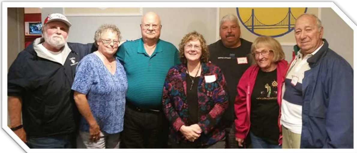
Some of the retirees who attended the May meeting: